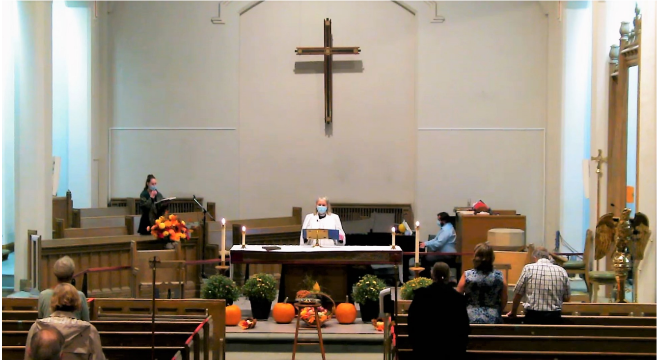
A view of the Church during our first 2021 limited in-person Worship Service on Sunday, October 3rd at 10 a.m.